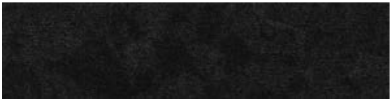
LAKE - 78 black