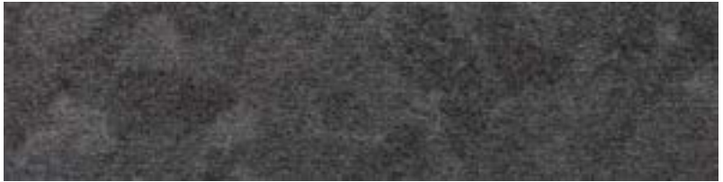
LAKE - 77 anthracite