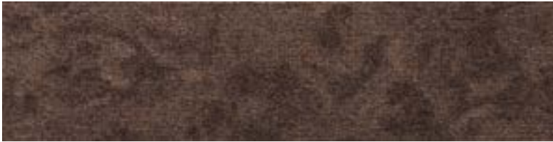
LAKE - 92 teak