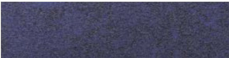
LAKE - 83 sea