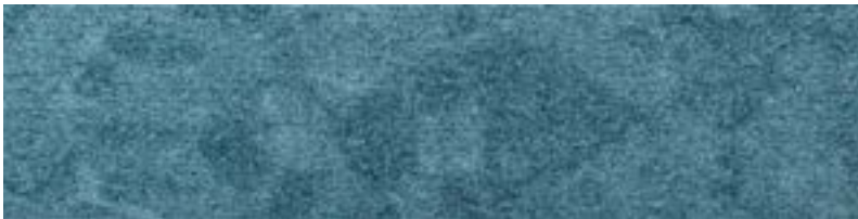
LAKE - 81 teal