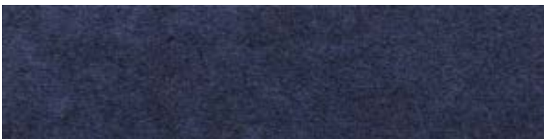
LAKE - 85 royal