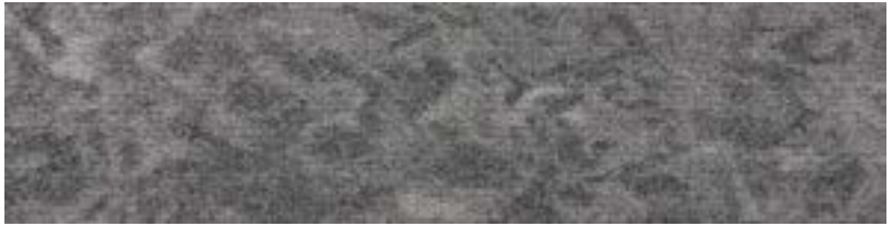
LAKE - 76 silver