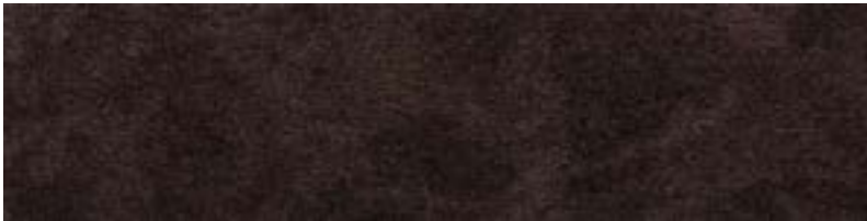
LAKE - 93 maroon