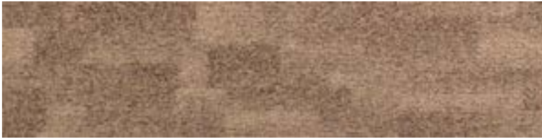
LAKE - 91 linen